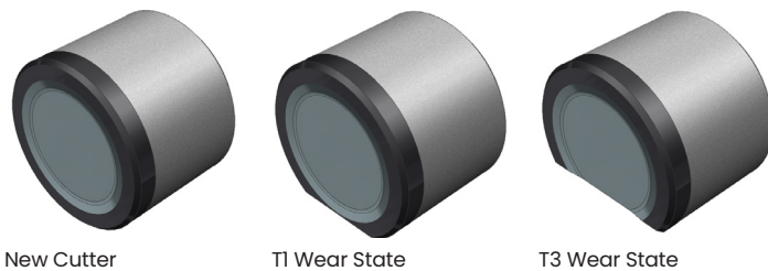
Figure 2: the angle where the diamond table interacts with the rock gets more aggressive as the cutter wears down, allowing the StayCool 2.0 shaped-cutter to maintain a more aggressive cutting edge