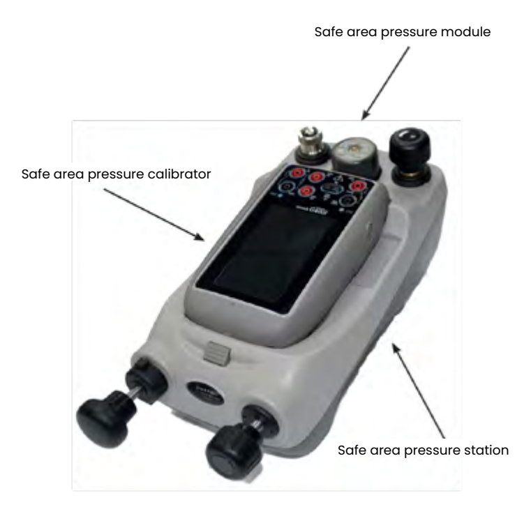
The pressure calibrator securely attaches to the pressure station when pressure generation and measurement are required.