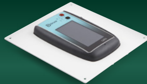
DPI620G + Panel Mount accessory Electrical/Pressure measurement as part of test bench system