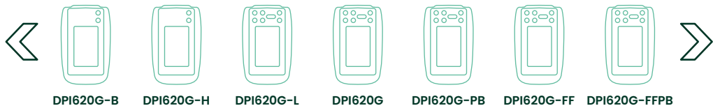
DPI620G-B DPI620G-H DPI620G-L DPI620G DPI620G-PB DPI620G-FF DPI620G-FFPB