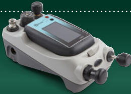
DPI620G + PV621 + PM620 Portable 20 bar/300psi pneumatic pressure calibrator