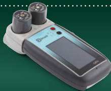
DPI620G + MC620G + PM620 1,000 bar/15000psi pressure calibrator