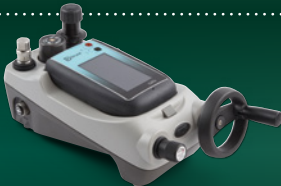
DPI620G + PV623 + PM620 Portable 1,000 bar/15000psi hydraulic pressure calibrator