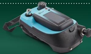
DPI620G + PV624 + PM620 20 bar/300psi hybrid pneumatic pressure calibrator