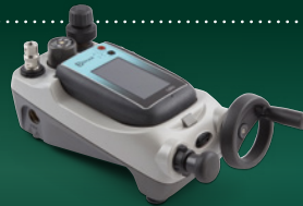
DPI620G + PV622 + PM620 Portable 100 bar/1500psi pneumatic pressure calibrator