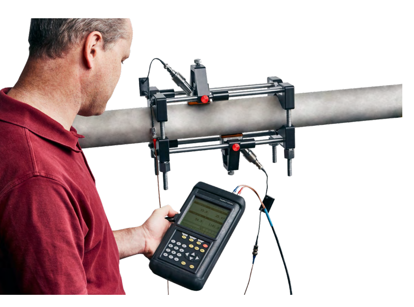
Optional pipe wall thickness gauge

Pipe wall thickness is a critical parameter used by the TransPort PT878GC flowmeter for clamp-on flow measurements. The thickness-gauge option allows accurate wall thickness measurement from outside the pipe.