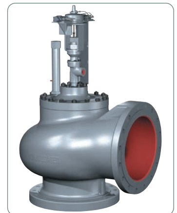
Dump Valve Design