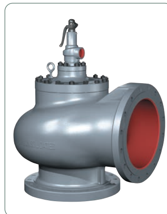
Omni Pilot Discharge Piping