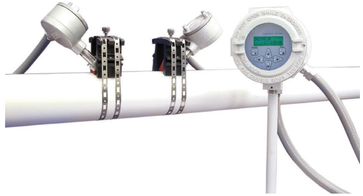
DigitalFlow XMT868i shown with clamp-on transducers

To minimize the effects of flow profile distortions, flow swirl and cross flow, and for maximum accuracy, you can install the two sets of transducers on the same pipe.