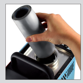
Infrared calibration insert P/N IOPTC-INF-1