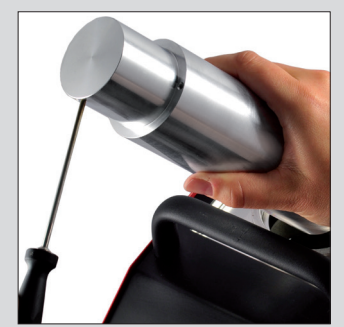
Surface calibration insert P/N IOPTC-SURF-1