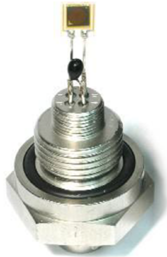
Figure 1: Aluminum oxide sensor with temperature sensor on a process mount with Viton O-ring

Factory calibration of these sensors is better described as characterization. The sensor is exposed to varying levels of water vapor, with nitrogen or air as the carrier gas. At each moisture content, the raw signal (capacitance, impedance, etc.) is recorded. This table of moisture content with its corresponding signal is programmed into the analyzer or transmitter. The typical recalibration cycle is once a year.