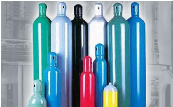
Figure 3: Gas cylinders

Instrument technicians are very familiar with the use of calibration cylinders. These are used extensively to calibrate other analyzers such as oxygen analyzers. There are several manufacturers of calibration cylinders for water vapor. Typically, these are provided with nitrogen as a background gas. Although available down to 1 ppmv, practically, 10 ppmv has been the lower limit.