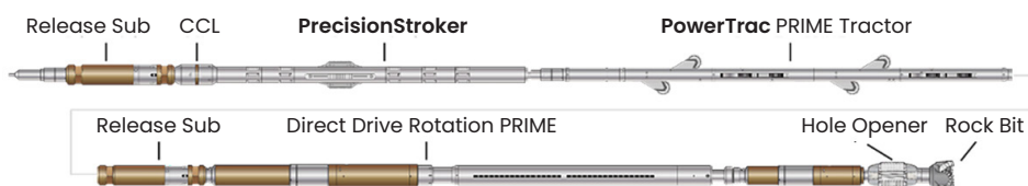
Debris Mill Toolstring, with Tractor and Stroker