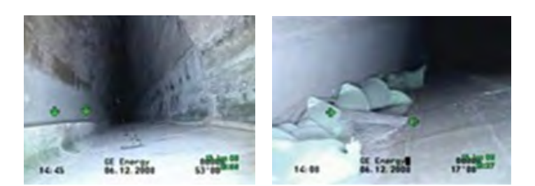
Visual inspection shows the actual condition inside the blades.

Because they are subjected to tremendous aerodynamic forces, turbine blades can suffer fatigue-related damage, particularly crack-forming delaminations. High blade-tip velocities can erode the blade's leading edge, while constant stall on the trailing edge can degrade the laminates.