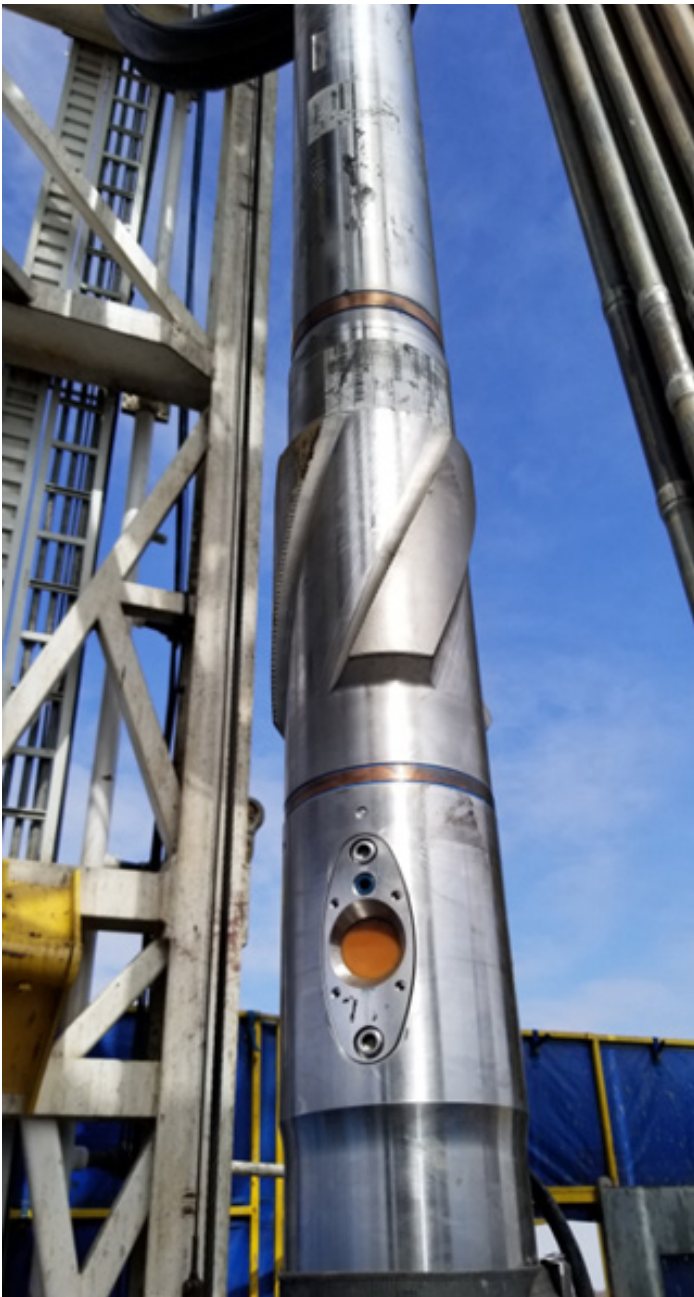
The CICM (casing integrity and cement mapping services) tool eliminates the HSE concerns and processes necessary for handling radioactive sources.