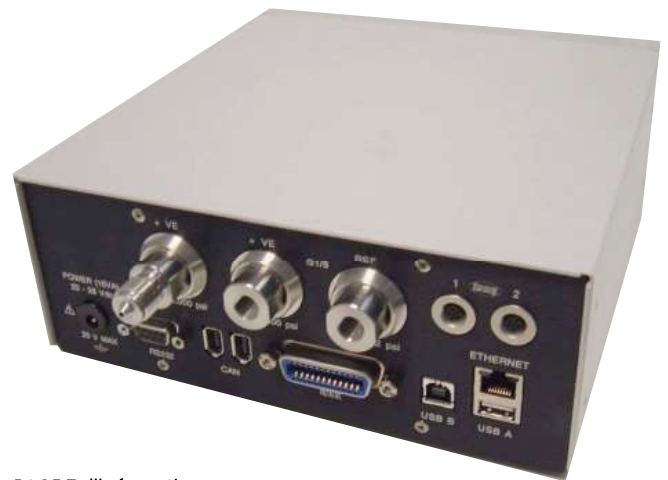
PACE Tallis from the rear

Tallis will be supplied with appropriate standard compliance labelling (STD). Additional regional specific labelling may also be made available as required