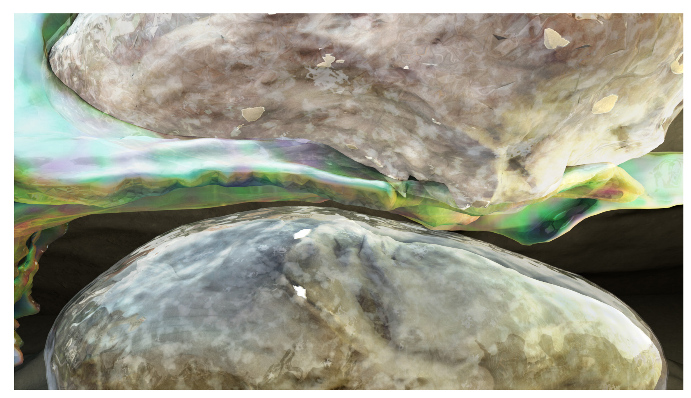
Polymer attaches to the sandstone formation through a covalent bond—preferentially in tight spots (pore throats). The highly water-wetting polymer "lays down" in the presence of hydrocarbons (repelled).