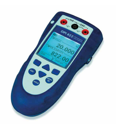
DPI 822 Handheld Thermocouple Calibrator