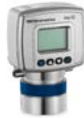
O2X1 galvanic fuel cell oxygen transmitter