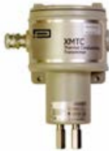
XMTC thermal conductivity gas transmitter