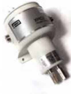
XMO2 thermoparamagnetic oxygen transmitter

The TMO2D provides long-term, hands-off operation with this optional feature. When initiated, the TMO2D controls solenoid valves in the sample system to bring zero and span gases to the transmitter. Then TMO2D software compares the calibration gas readings with factory data to verify proper calibration. If an adjustment is necessary, the TMO2D makes corrections automatically and notifies the user via the front panel display and alarm contacts.