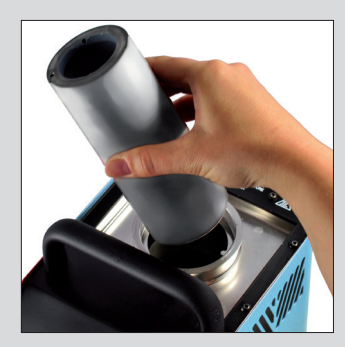
Infrared calibration insert P/N IOPTC-INF-1