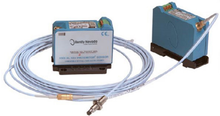
Bently Nevada Proximator® and probe. Designed with Gold Standard Methods

More concerning than even this is the impact an erroneous reading has on a critical thrust protection measurement. Devastating thrust failures can happen within milliseconds, long before a human being has the ability to react. Because of this, many systems use dual voting or even a Triple Modular Redundant (TMR) thrust system. The implications of the incorrect scaling of a Frankenstein system in this scenario are even worse.