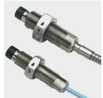
3300XL 11mm Proximator® Probes, both Armored and Unarmored cable versions shown

With a fully interchangeable system like the Bently Nevada 3300XL, the plant simply replaces the damaged Proximator or cable with an off-the-shelf spare part and continues to run, no calibration or special tools required and no need to disturb the probes installed deep within the machine. In fact, because of our gold standard and unmatched interchangeability, all of the machines at the plant can use exactly the same Proximator drivers and cables and with a few different probe options, the plant's entire needs can be covered by just a handful of spare parts shared amongst all the machines, which lowers maintenance costs and reduces the chances of system mismatch.