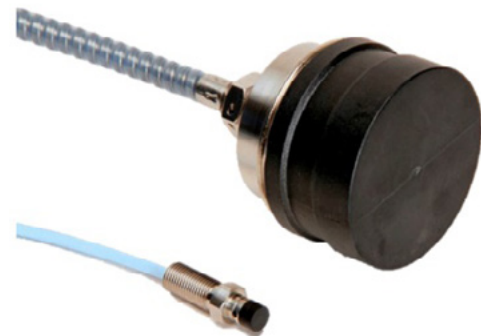
3300XL 8mm and 50mm Proximitor® probes

Bently Nevada takes the reliability and safety of our customer’s operations very seriously and over the years we have labored to earn your trust with your most critical machines. In turn, you have come to trust in our solutions and our expertise, and the fact that we do not compromise when it comes to safety, quality, and reliability. This is our commitment to our customers now and into the future.