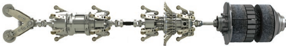
MagneScan™ SHR Plus

Please contact your local sales representative for more information.