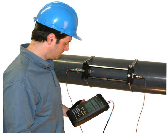
Portable flow meter user

Portable ultrasonic flow meters are designed for short-term survey and monitoring. Typically, they are compact and lightweight and meant to be temporarily installed and moved from site to site. Portables typically include the flow electronics, external components like fixtures, transducers and cables, and accessories such as thickness gages and carrying cases. Because portables are often shared by multiple users and/or used on an irregular basis, ease of use and confidence in the measurement provide unique challenges and opportunities for clamp-on manufacturers.