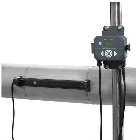
AquaTrans AT600 flow meter

The AquaTrans* AT600 is the latest in the Panametrics line of clamp-on ultrasonic liquid flow meters. It features a user-centered design that focuses on ease of use, cost-efficiency and reliability. The AT600 is installed directly on a pipe in just minutes without shutting down the process and then left in place without maintenance and calibration. It handles a broad range of liquid flow applications like water/wastewater, industrial, HVAC, hydroelectric, and agriculture.