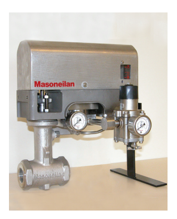
Varipak full Stainless Steel