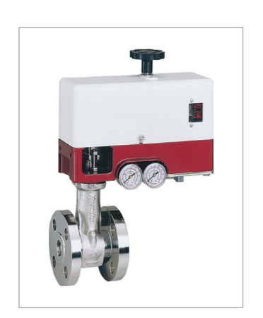
Optional Flanged Varipak Control Valve