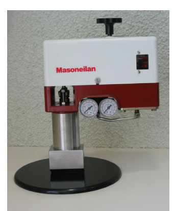
High Pressure Varipak