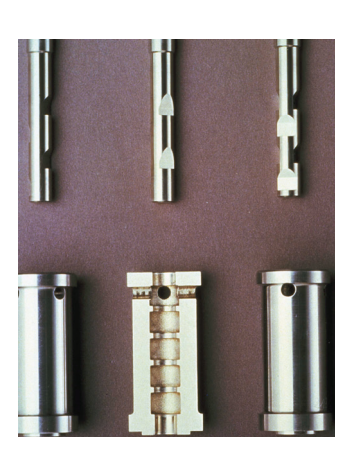
Varilog Trim Subassembly