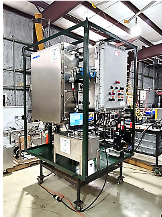
The IntelliSweet™ chemical automation system.

These automated solutions are specifically designed to meet your application needs and optimize your chemical treatment program. Contact your Baker Hughes representative to learn how the IntelliSweet controller can enhance savings and increase the efficiency of operations.