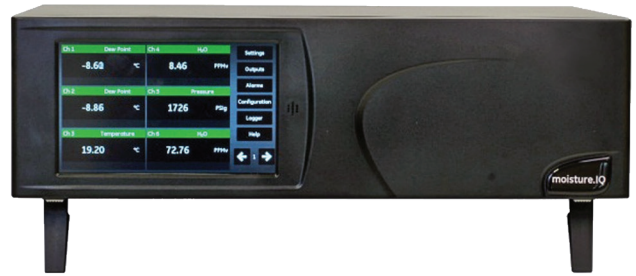
Bench mount version

The moisture.IQ is the multichannel, multifunction flagship model in the IQ Series of Panametrics aluminum oxide-based moisture analyzers. The moisture.IQ measures trace moisture, pressure and temperature in non-aqueous liquids and gases. It accepts inputs from electrochemical sensors for measuring oxygen concentrations in gases. The auxiliary inputs can accept analog inputs from any transmitter with 0/4 to 20 mA or -1 to +4 V output, including a variety of Panametrics process control instruments, this feature makes the moisture.IQ a true multifunction analyzer, providing cost savings through system integration.