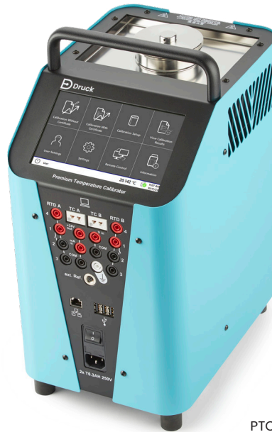
PTC165i Integrated measuring model